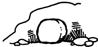
Jesus Was Buried