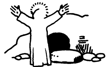
Jesus Rose Again!